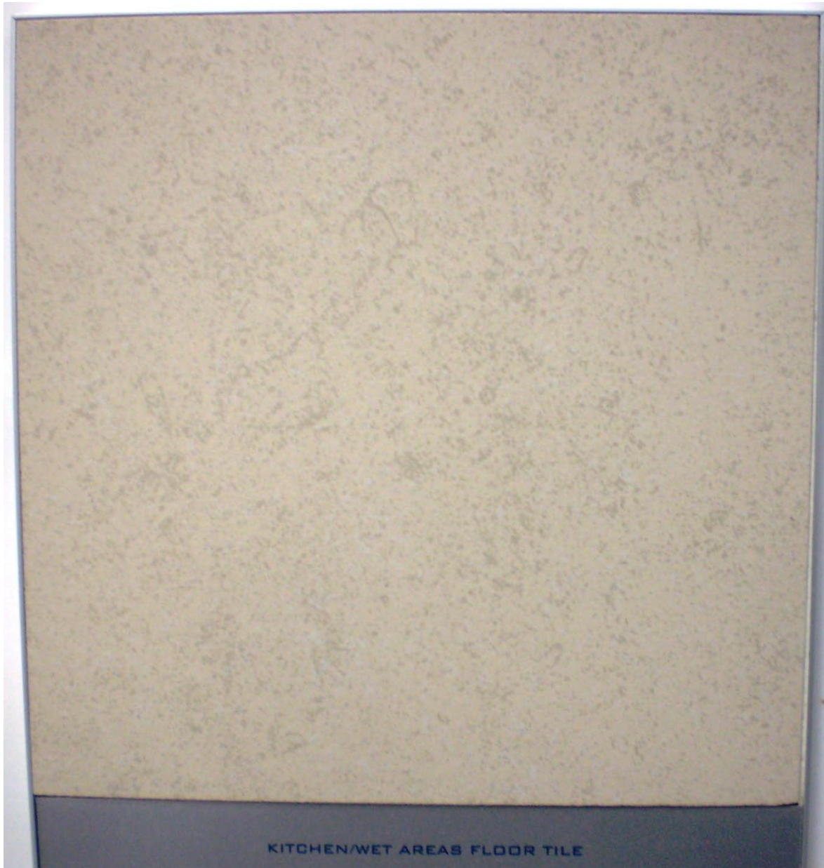
KITCHEN/WET AREAS FLOOR TILE

Level 1 20 Cecil Avenue CANNINGTON WA 6107